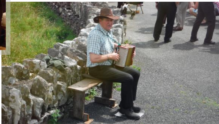
Every city had street musicians. This one was in England. That piece of curved sheet metal under his foot was his improvised drum.