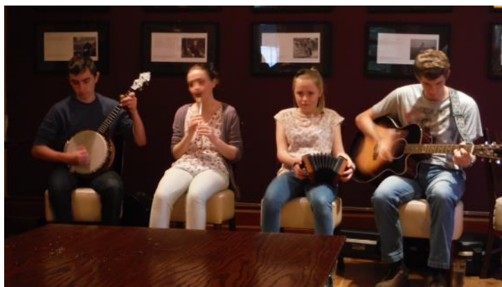
Fantastic family played traditional music in a pub in Ireland.. The youngest girl played terrific concertina, sang and danced.