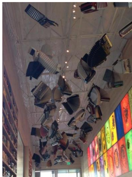
"Accordions in Heaven" featured at Chihuly Gardens in Seattle, Washington.

If you have a photo of one of your performances or a special interest photo and would like it posted on our Newsletter, send it to one of our newsletter committee members!